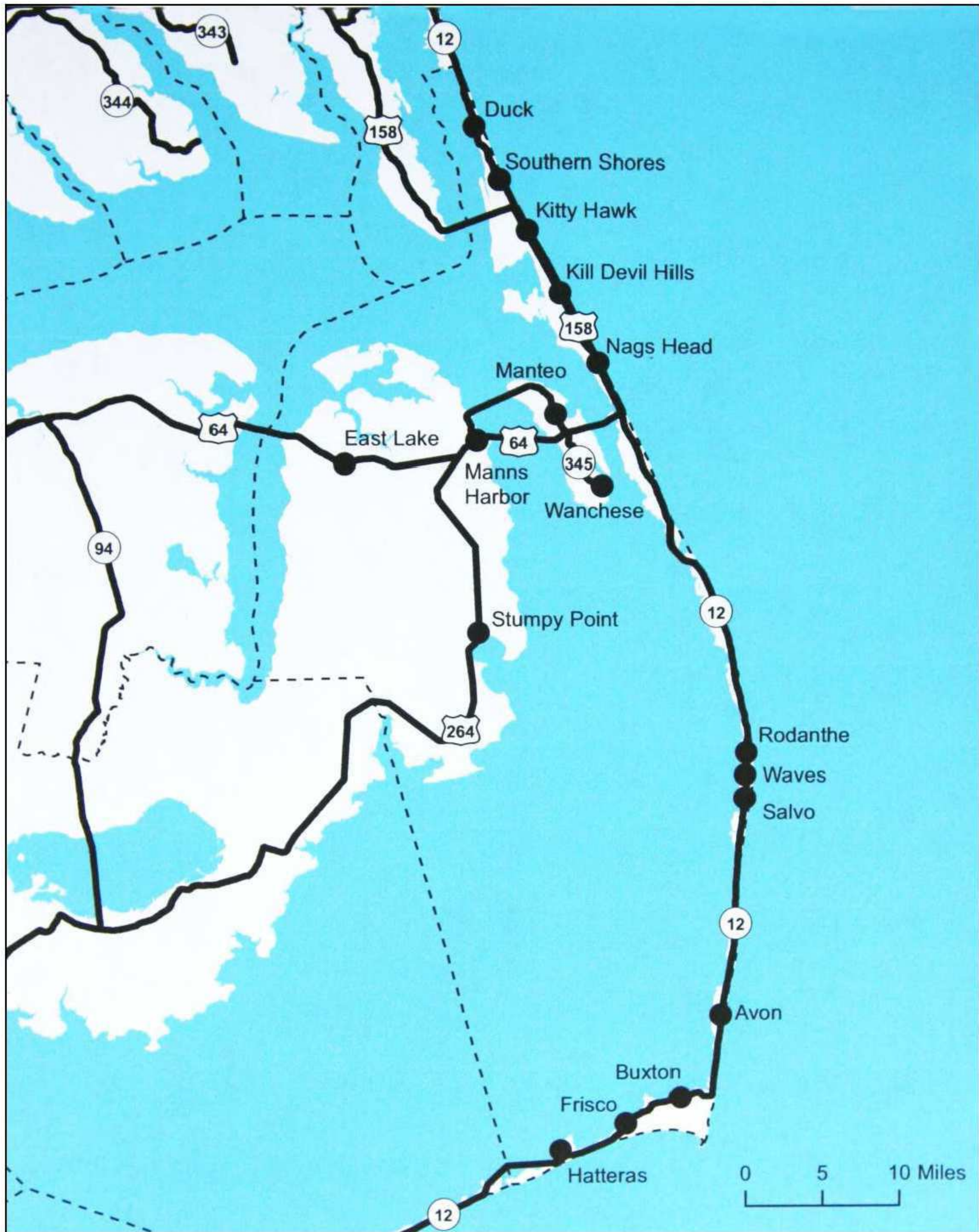
Figure 1. Towns and major roads in Dare County, North Carolina.